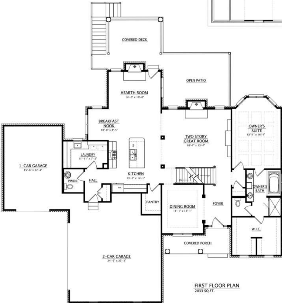
FIRST FLOOR PLAN 2033 SQ.FT.

All features, designs and prices are subject to change without notice. Sizes and dimensions are approximate.